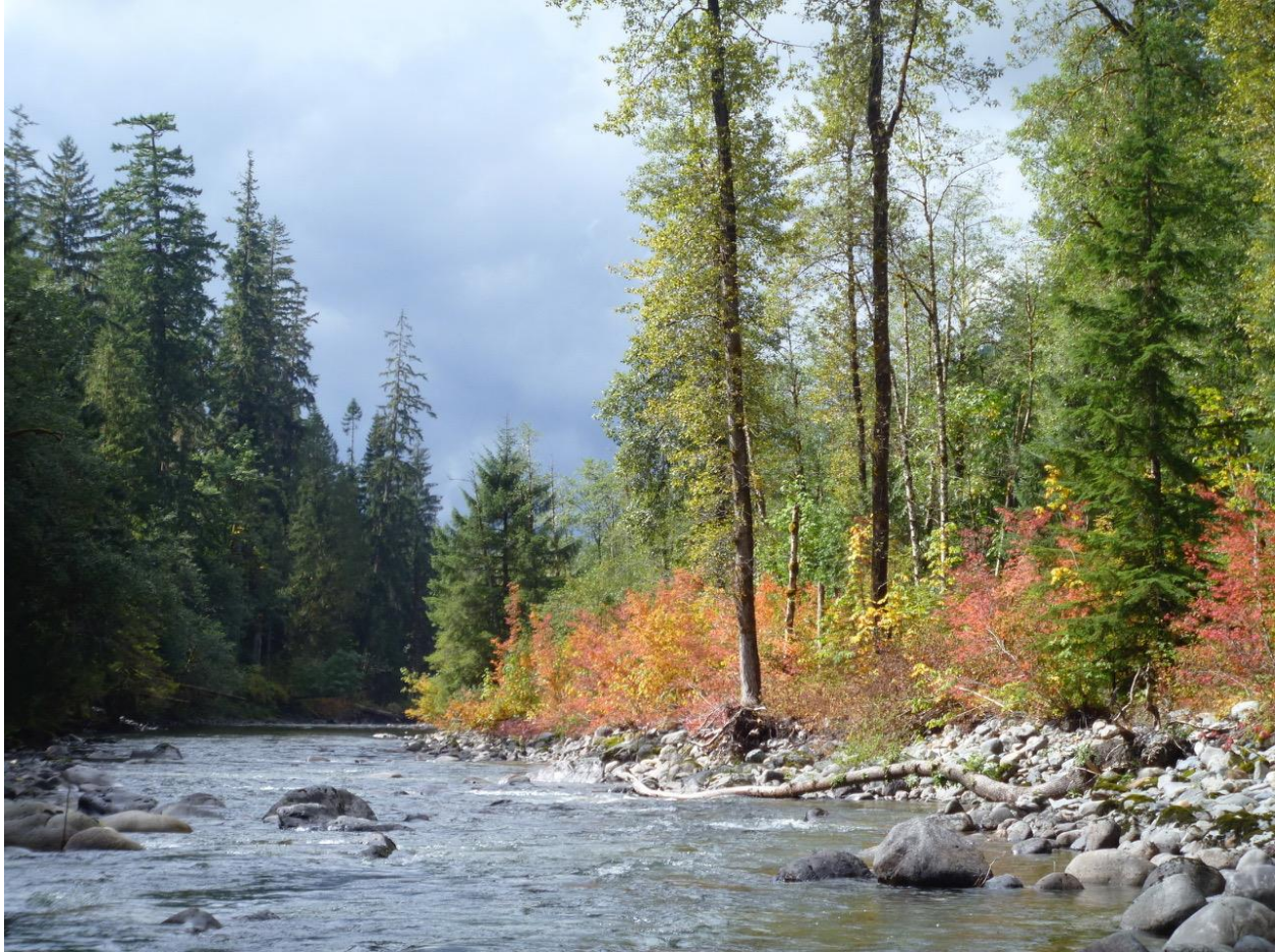
Somewhere on the Skagit/Sauk System – Dave Campbell