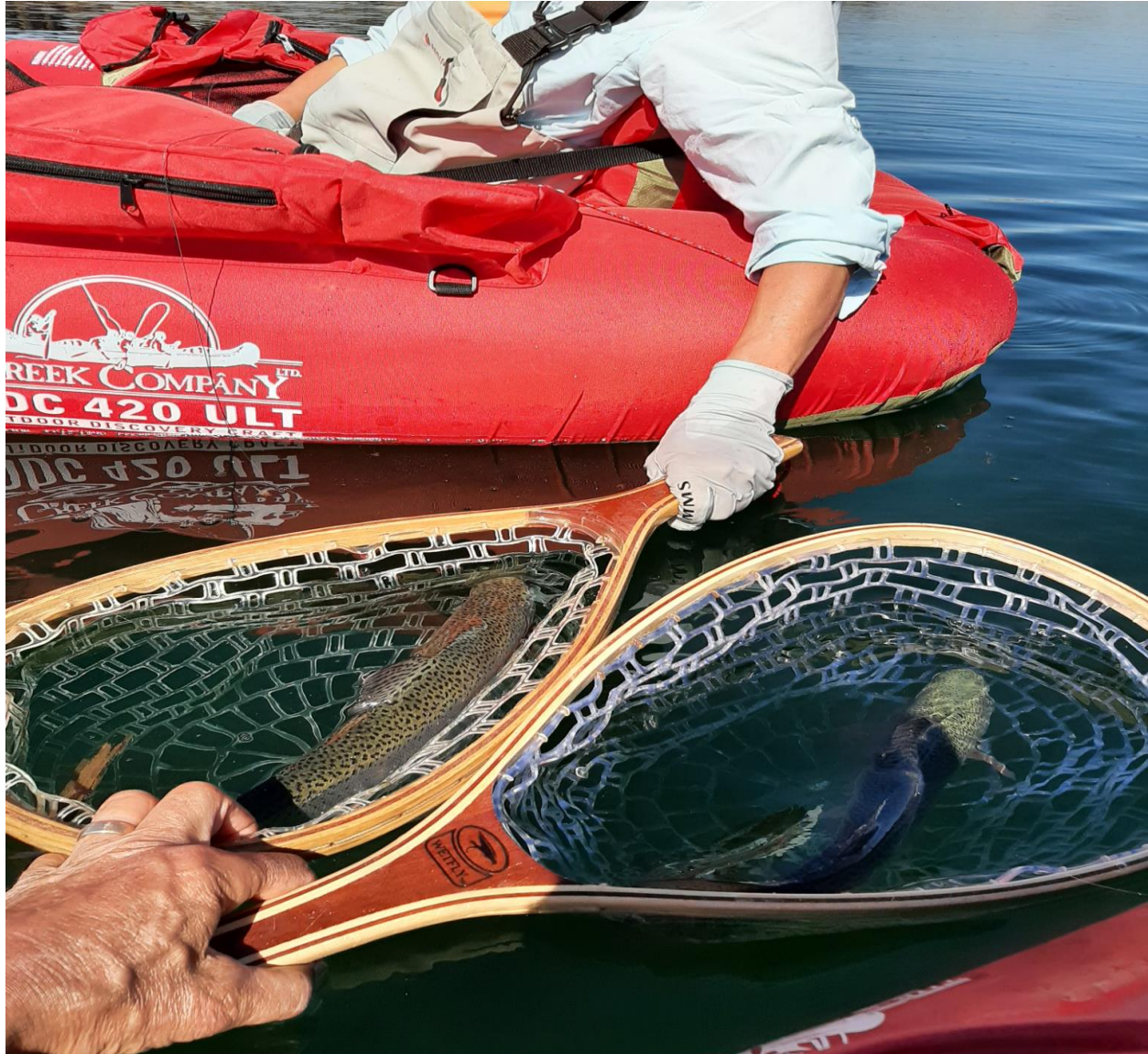
A float tube double at Lenice Lake.