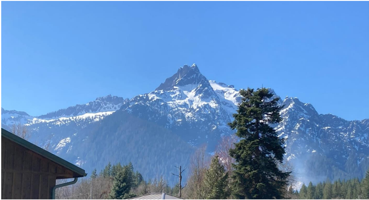
Looking south from Darrington.